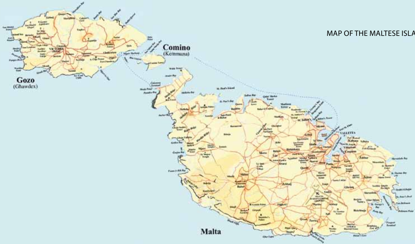
MAP OF THE MALTESE ISLANDS